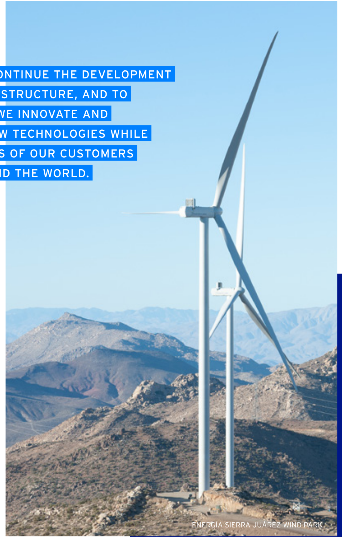
ENERGÍA SIERRA JUÁREZ WIND PARK

Helps advance the energy transition through lower carbon energy infrastructure.